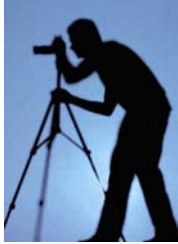
Photo Pricing: 1, 4x6 - $6 1, 5x7 - $8 1, 8x10 - $10 4 wallets - $5 High Resolution Photo CD - $15 (Copyright Free) Make all the prints you want – must order from studio

Parker Photographs: 766-7222 2740 Festival Lane, Festival Centre, Sawmill & Rt. 161