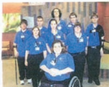
Above Photograph is the 2009/2010 SEARCH class in Dublin, Ohio at Dublin Methodist Hospital

"Dublin Methodist Hospital is committed to the highest level of patient care. In respect to the patients and their families, there will be no tours this evening." Opportunities for tours will happen at a later date.